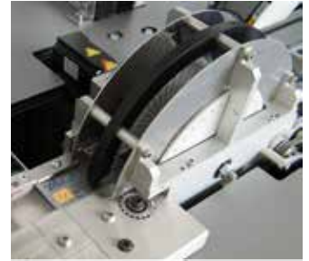
Flipping and Buffer